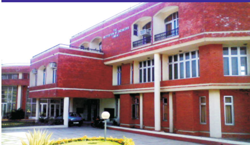
Facilities available at Institutional Complex, Channi Himmat.

The Institution has created facilities at Institutional Complex, Sector - 3, Channi Himmat, Jammu which is comprising of 03 Nos. AC Double bed Rooms, 03 Nos. Non - AC double bed rooms, 01 No. AC Lecture Hall and 01 No. AC Auditorium.