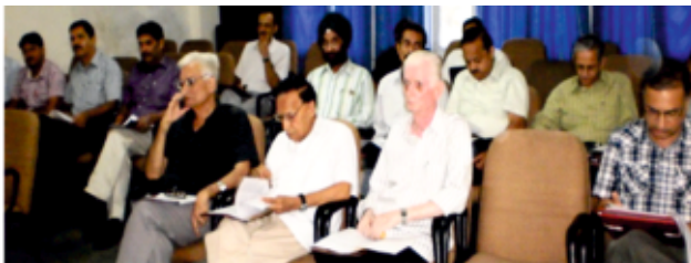
Engineers participating in the Seminar held on World Habitat Day