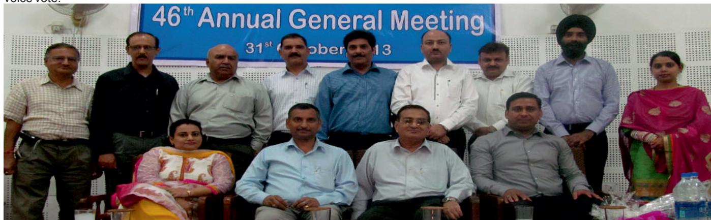
YET ANOTHER BEGINNING : Newly elected Committee Members posing for a photograph on the dais just after announcement of results.

The audited accounts for the year 2012 -2013 were reviewed by the members present in the house and were then passed with a voice vote.