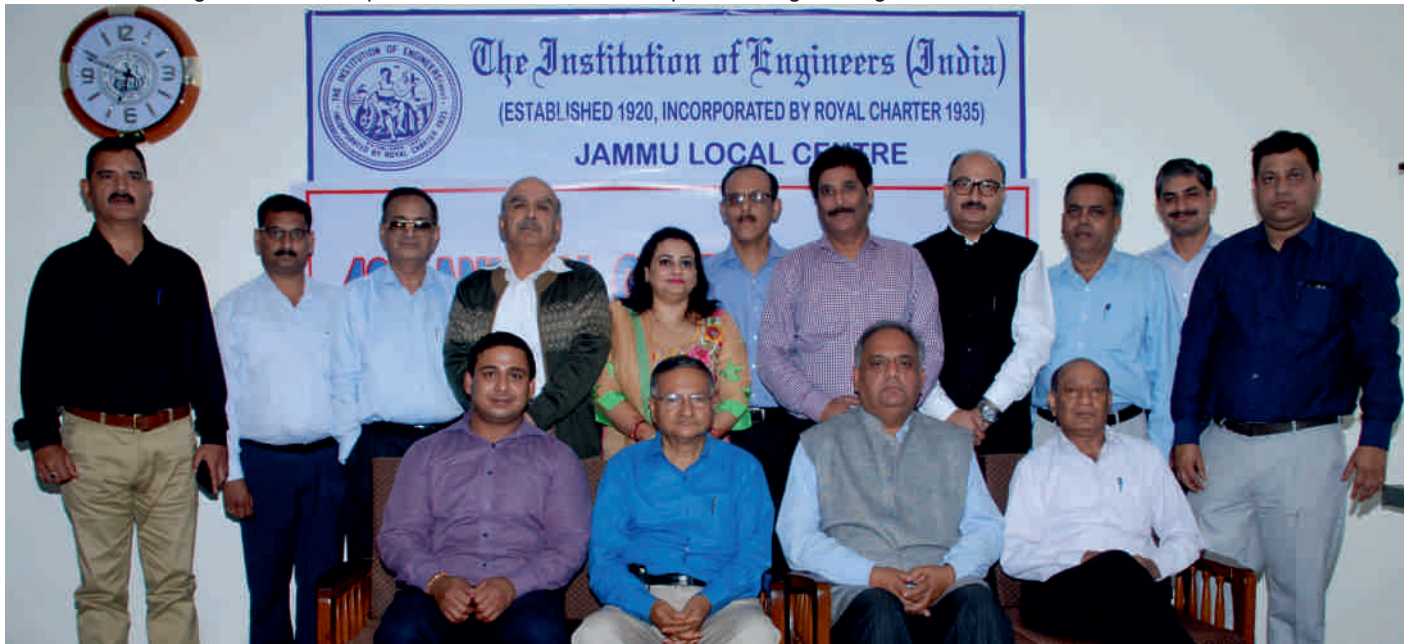
Newly elected Committee Members (2015 - 2017) posing for a photograph on the dais