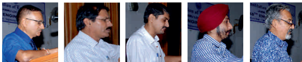
Engineers while presenting their papers on 48 th Engineers Day at IEI, Jammu Centre