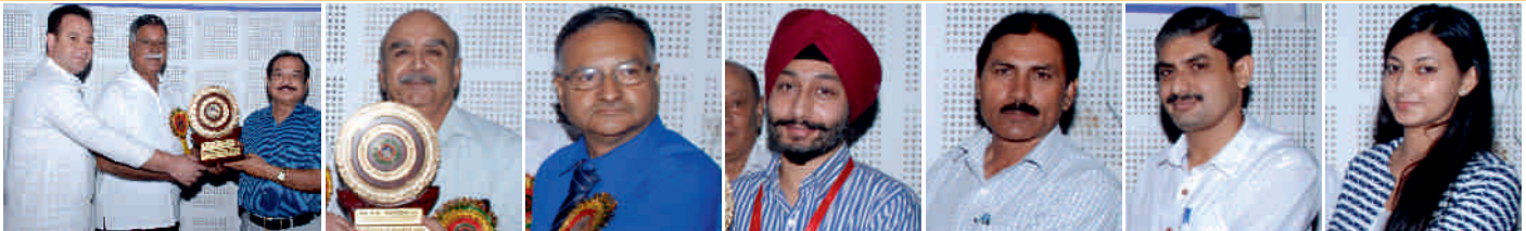
Engineers while receiving mementoes from the Chief Guest & Guest of Honour on 48 th Engineers' Day